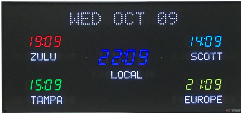
Model 6614E - 2.5" & 4.0" time, 10 character - 1.2" & 2.0" zone labels, 10 character 2" date on the top, 5 zones

The 6614 series time zone clocks have bar-segment LED time displays with ten character dot matrix digital zone labels displayed in 5 zones. Many 6614 models, the clock can display up to 20 time zones through page flipping. For example, the 6614A can show four pages of time zone information. Likewise, 6614H can show three pages.